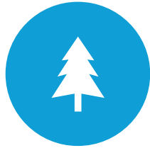
FOREST LAW (LAW NO. 6831)