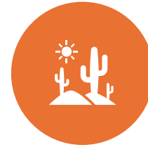
SOIL PROTECTION AND LAND USE LAW (LAW NO. 5403)