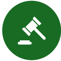
PUBLIC HEALTH LAW (LAW NO. 1593)