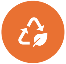
ENVIRONMENTAL LAW (LAW NO. 2872)